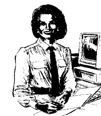
Dispatchers are the vital link...

The purpose of this two (2) day seminar is to provide dispatchers advanced technical, human relations and operational training to more effectively and efficiently perform their duties. Topics will include: Use of LEADS/NCIC; Telephone/Radio Etiquette; Note Taking; Multi-Tasking; Voice Stress; Human Relations/Conflict Management; Crisis Management; Stress Management; & Media Relations.